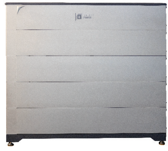
BMS with four 4.9kWh modules shown