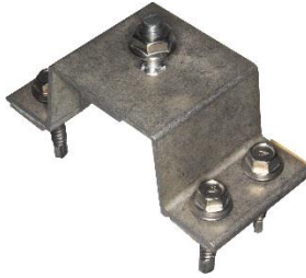
KHRT25-M Serrated Nut and 4 x 1/4" x 1 1/2" Self Drilling Screws