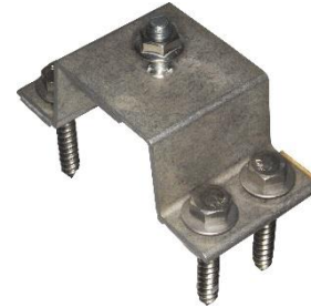
KHRT31-M Serrated Nut and 4 x 5/16" x 1 1/2" Lag Bolts