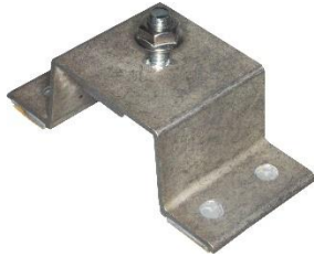
KHRT-M Serrated Nut