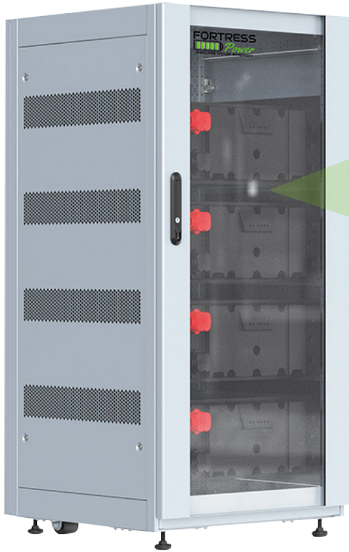
* battery not included